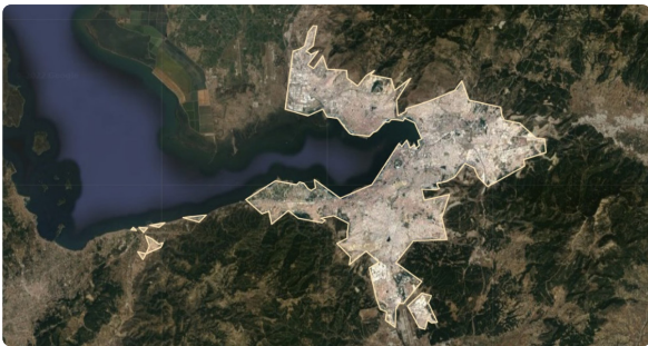
Figure 2: Corrected boundaries for Izmir in EIE