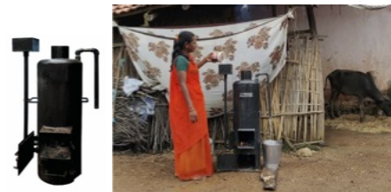
Figure 3: The "Bumbb" water heater