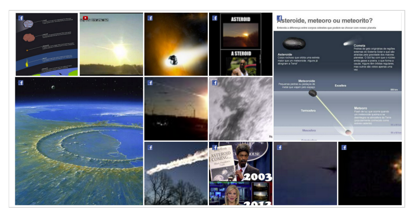
Figure 2: Zoomed view of the Media Gallery tab of the application showing an automatically generated media gallery in loose order, varying size style featuring ranked media items stemming from Facebook and YouTube for the query Метеороид

Figure 1: Media Item Clusters tab of the Social Media Illustrator application with individual and clustered (bottom middle) media items from Facebook and YouTube, ranked by popularity for the Russian query Метеороид