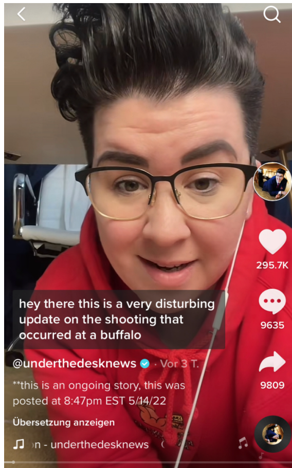
Figure 2: Example from @underthedesknews on TikTok providing calm, quietly-spoken news from underneath a desk, about a recent shooting in Buffalo.

entangled; (2) Gen Zers’ information journeys often do not begin with a truth-seeking search query; and (3) Gen Zers use information to orient themselves socially and define their emerging identities. We handle RQ3 (susceptibility to misinformation) in 5.2.