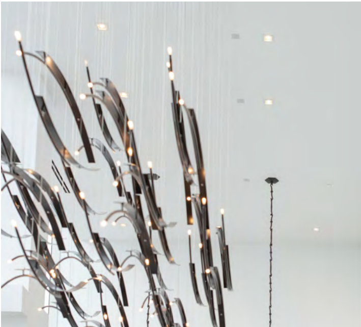
James Loudspeaker Small Aperture speakers deliver room-filling, accurate sound reproduction from a barely visible 3-inch grille