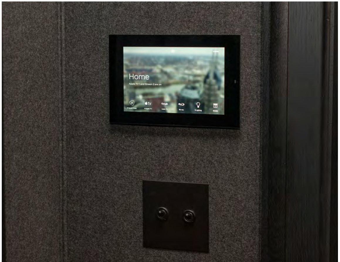
The intuitive Savant control system features Savant Scenes such as "Home" pictured here