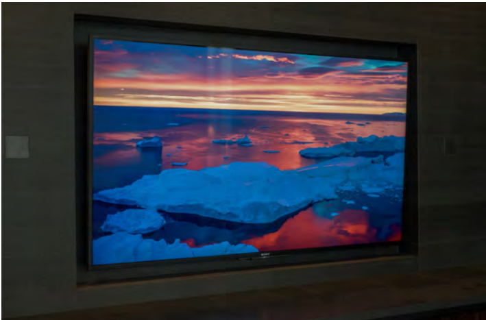
The office TV features a Small Aperture speaker with custom grilles on either side to ensure clarity for all programming

The whole-house entertainment speakers are all James Loudspeaker Small Aperture through the 8-zones. The model 63SA-7HO delivers full frequency response with wide dispersion into any room along with extended and detailed bass, eliminating the need for dedicated subwoofers in each zone. Because of their aircraft-grade aluminum enclosure and aluminum driver array, Small Aperture speakers are also ideal for humid environments, such as the master bathroom. The James Loudspeaker Small Aperture speakers play through a tiny 3-inch grille