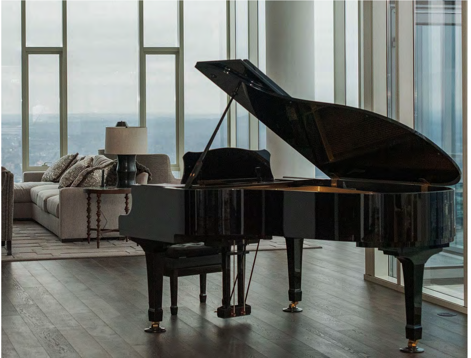
The 505 penthouse features a baby grand piano and stunning views