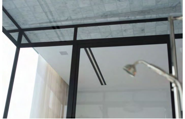
James Loudspeaker Small Aperture speakers are designed to handle high-humidity locations such as the ceiling of this washroom

designed to match the elegant square-style LED lighting fixtures.