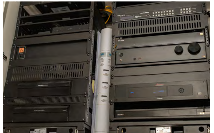
The James Loudspeaker M1000 DSP-enabled subwoofer amplifier resides with other electronics in the equipment rack

The entire living space within the penthouse features premium entertainment available on demand in each zone. The living room theater system is the only zone that required a subwoofer, and the PAVE team selected a James Loudspeaker Small Aperture (101SA-6) architectural subwoofer mounted to studs in the ceiling. The 101SA-6 features an all-aluminum bandpass enclosure housing a 10-inch woofer mated to an elegant, compact 4-inch grille. The subwoofer is powered by a James Loudspeaker M1000 1000-watt subwoofer amplifier with DSP capability for perfect room calibration. The subwoofer amplifier, surround receiver and smart home electronics are housed in an equipment rack tucked out of sight in the laundry room.