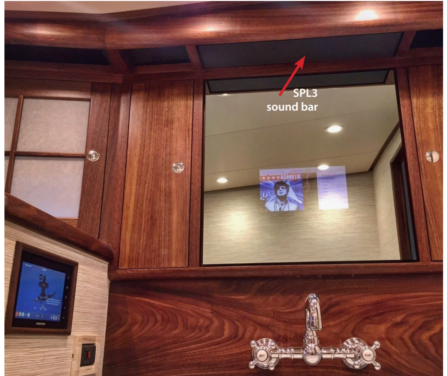
A down-facing SPL3 sound bar nestled into the woodwork above the mirror delivers sound in the master head

The Crew Quarters was outfitted with a sound system as well (“we have to take care of the captain,” said Blanchard) with another built-to-match SPL3 sound bar and a PowerPipe subwoofer nestled under the bunk. The captain can use the video switching capability of the Crestron control system in order to view all nautical data as well as the engine room and outdoor camera images on the entertainment screen in the Crew Quarters.