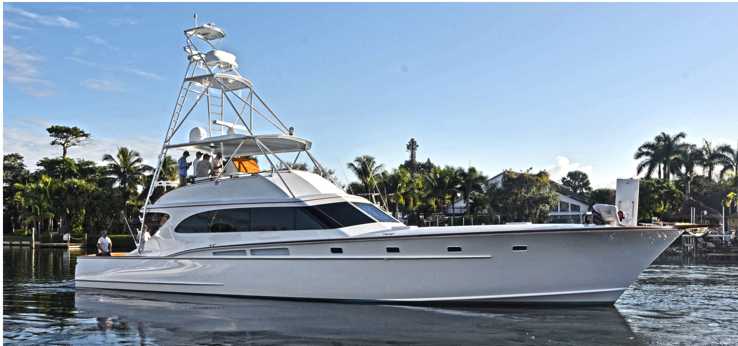
Lady Rebecca, a 68 custom fishing boat outfitted for sound by Creative Systems USA with James Loudspeaker marine-grade speaker systems