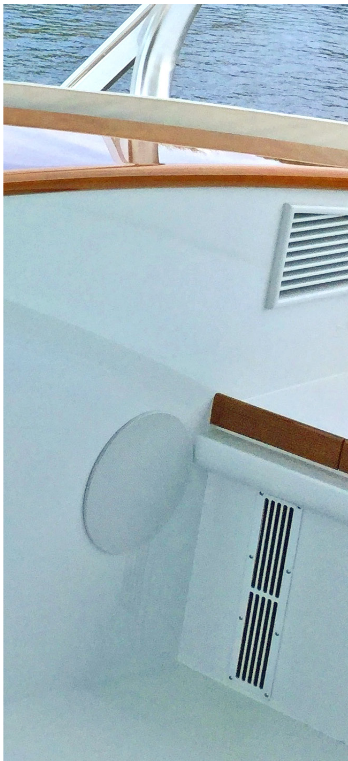
On the bridge, the round QXC620 grille is visible beside the vertically mounted toe-kick grille for the PowerPipe subwoofer

The Salon, which is akin to a living room area, features a 5.1 surround system. The front LCR speakers are a pair of custom-sized James Loudspeaker SPL3CS sound bars mounted on either side of a motorized Sony 55-inch TV. The SPL3CS bars use James Loudspeaker's proprietary Centergy™ technology that incorporates a center channel driver into each right and left speaker, eliminating the need for a dedicated center speaker below the TV. The Salon system also includes a pair of 63SA-7HO Small Aperture speakers used as rear channels within the 5.1 system. The subwoofer in the Salon is a PowerPoint 800PTM, delivering detailed and extended bass response for both music and cinematic content. Once again, the rear speaker and