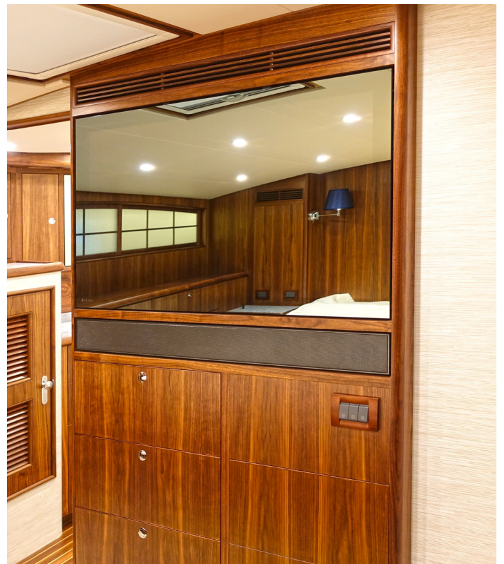
The James SPL3 LR sound bar fits precisely into the elegant cabinet work of the master stateroom

The rear covered area of the boat used for fishing, otherwise referred to as the cockpit, utilizes a pair of the Small Aperture speakers and a pair of Small Aperture subwoofers nestled into the “roof” extending over the cockpit’s beautiful teak “fighting chair.” All that is visible are small, décor-matched grilles yet the sound is full range and clearly dispersed throughout the cockpit and mezzanine areas. Each of the two 540SAS-4 subwoofers use four 5.25-inch woofers in a tuned enclosure, with low frequencies vented through a 4-inch grille. James Loudspeaker engineers created a custom enclosure to accommodate the unusual space restrictions of the mezzanine overhead while maintaining the required internal air volume for optimized performance. “This is a perfect example of why James Loudspeaker is such a valued partner to Creative Systems USA—we were able to deliver superb sound from tailored solutions where off-the-shelf products would never do,” Blanchard stated.