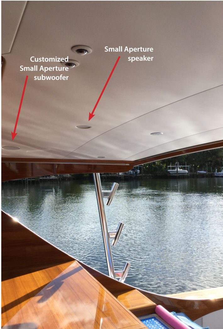
Décor-matched grilles for the Small Aperture speaker and custom subwoofer visible in the cockpit overhang