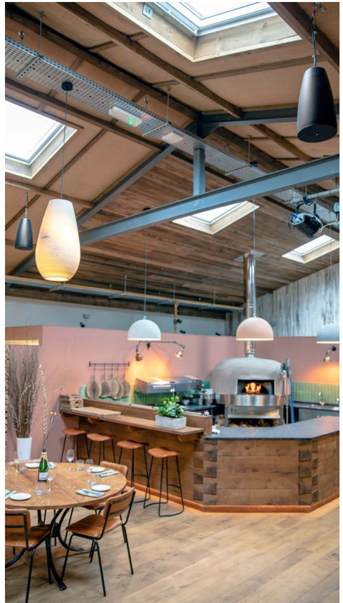
Sonance Pro Series pendants and a bandpass sub provide discreet full range audio at the Farm Table restaurant

Says Tim: “the audio design involved twin Sonance PS-P83T 8-inch pendant speakers supported by a discreetly installed Sonance PS-S210SUBT 2x10” bandpass sub covering The Farm Table restaurant bar area and seating, and six PS-P63T 6.5-inch pendants over the remaining seating and retail areas, in addition to eight Sonance PS-C63T 6.5-inch in-ceiling speakers at the Cow & Cacao Café. “Outside there are two PS-S63T 6.5-inch surface mount speakers installed at the rear courtyard walkway to the upper terrace, where four further PS-S63Ts are mounted on the surrounding wooden screens, which are decorated with planted recesses. The PS-S63Ts are joined by three Sonance Landscape Series LS6T all-weather satellites hidden in the floor planters.”