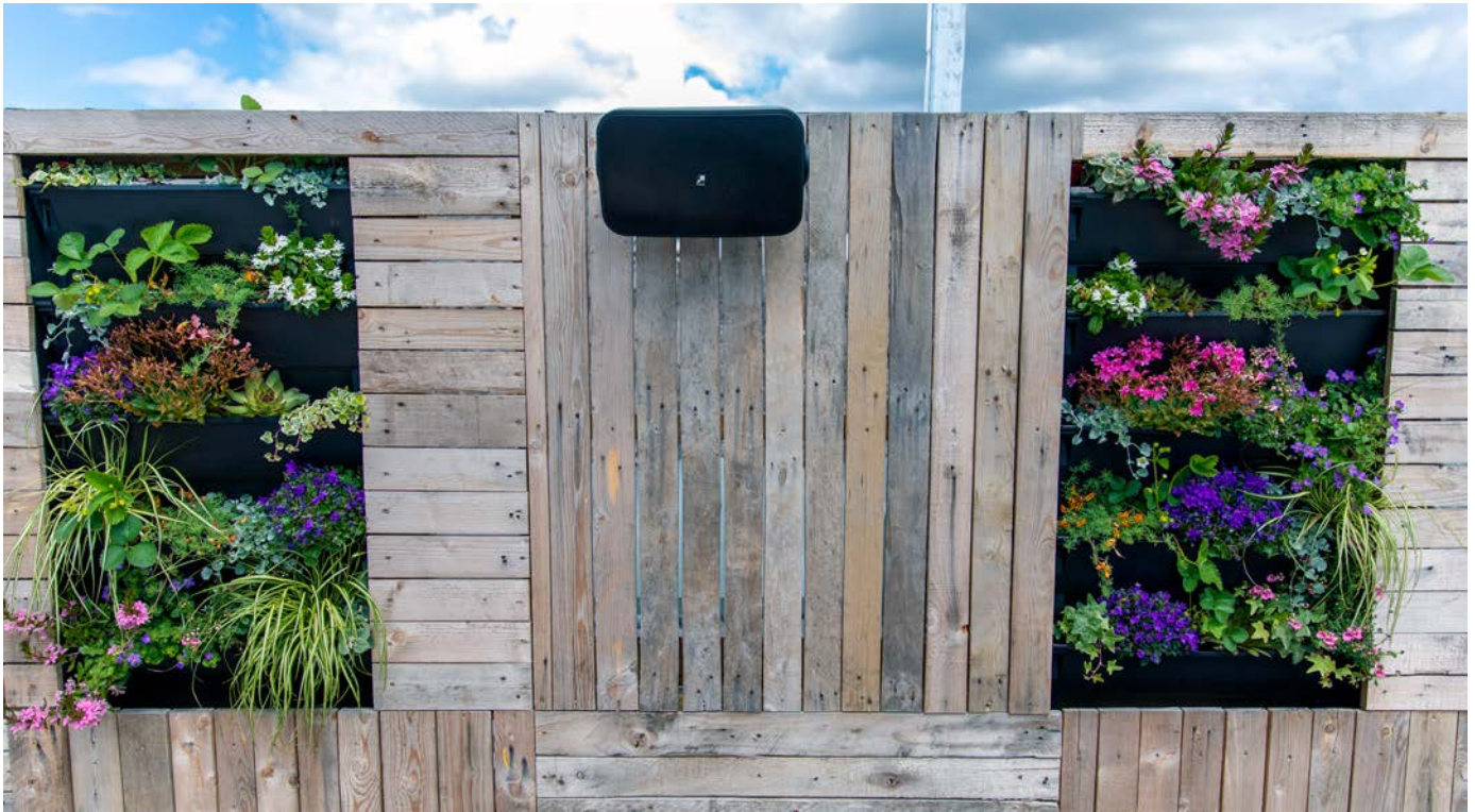
Sonance Pro Series PS-S63T surface mount speakers are mounted on wooden screens surrounding the Upper Terrace