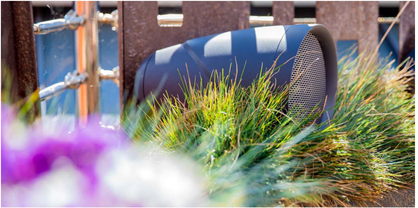
Sonance Landscape Series LS6T satellites are hidden in planters outside on the Upper Terrace catering area

"The systems are line driven by Yamaha XMV eight and four channel power amplifiers through a Yamaha MTX5-D DSP processor with Dante, locally supplemented by Yamaha PX3 and PA2030 amps. "Intuitive local control over volume and zone is via wall mounted Yamaha MCP-1 and DCP-1 panels. "The teaming of Sonance and Yamaha has yielded great results for us and is very reliable, so for commercial audio jobs like this it's our go-to combination, and as a range, the Sonance Pro Series speakers are perfect for most applications, being elegantly discreet and having common voicing from pendant, in-wall and on-wall. "This means you can mix the speaker types according to the job and achieve consistent sound quality throughout. "They're switchable between 8ohm/100V operation and they all have pivoting tweeters for local fine tuning. "In application they sound just fine at virtually any level, with a rhythmic detail that anyone would notice, complete with sufficient full-range dynamics for the sound to be present but not obtrusive, if that's what you want."