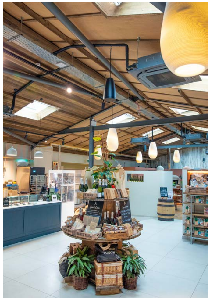
Further Sonance Pendants extend the high quality ambience to the Farm Shop