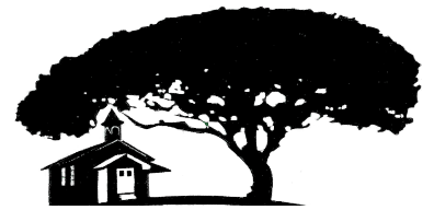
The Preschool at Kapalua