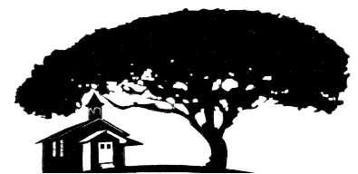
The Preschool at Kapalua