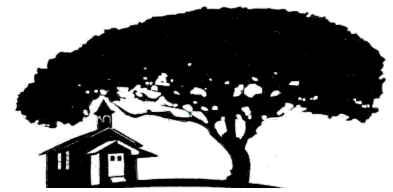
The Preschool at Kapalua