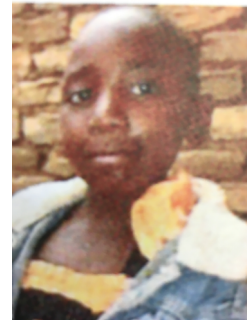
Skola Mwaisyeto - Tanzania