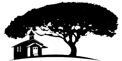
The Preschool at Kapalua