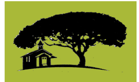
The Preschool at Kapalua