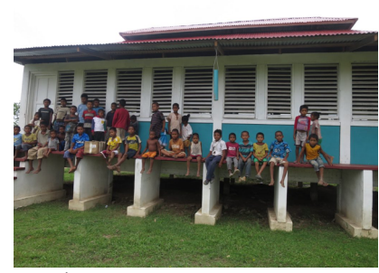
Bellos Andres Elementary-BOOM, Honduras Project Ezra Schools - Seek the Lamb