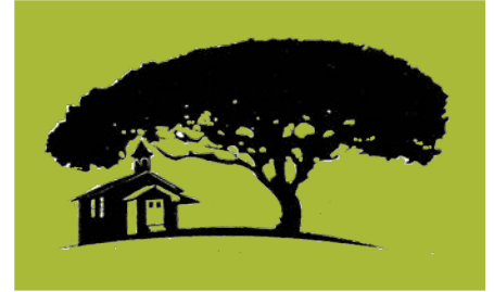
The Preschool at Kapalua