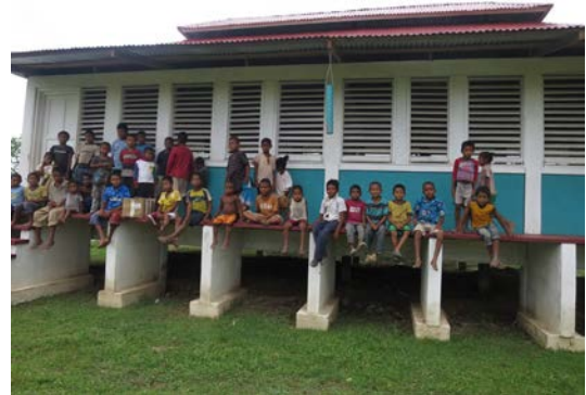
Andres Bello Elem Project Ezra School Seek the Lamb - Boom, Honduras