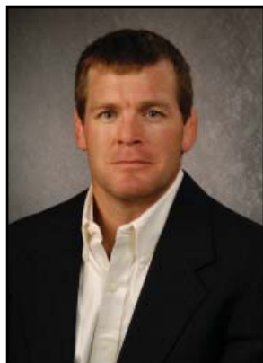
Tom Brands Head Coach (University of Iowa, 1992)

23 NATIONAL TITLES • 34 BIG TEN TITLES • 80 NCAA INDIVIDUAL TITLES • 191 BIG TEN INDIVIDUAL TITLES • 301 ALL-AMERICA HONORS