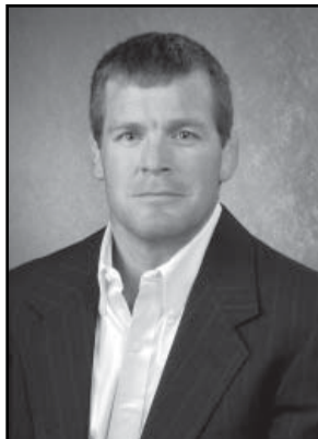
Tom Brands Head Coach (University of Iowa, 1992)

23 NATIONAL TITLES • 34 BIG TEN TITLES • 79 NCAA INDIVIDUAL TITLES • 190 BIG TEN INDIVIDUAL TITLES • 297 ALL-AMERICA HONORS