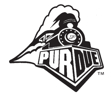
Purdue University 9-3-2, 3-0-1 Sunday, 1 P.M. (CT) UI Soccer Complex