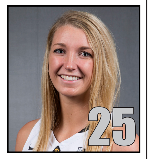
Forward • 6-1 • Senior Sauk Centre, Minn. Sauk Centre

2015-16... Team elected co-captain... has played in 20 games with 20 starts this season... netted two points and pulled down two rebounds at Northwestern (Jan. 31)... scored six points and earned two rebounds against Penn State (Jan. 20)... netted 12 points and tallied four rebounds at Michigan State (Jan. 16)... scored six points and tallied five rebounds in lowa's win at Wisconsin (Jan. 13)... earned five rebounds and netted four points against Maryland (Jan. 10)... compiled two points, two rebounds, and one block at Michigan (Jan. 7)... posted three rebounds and two points against Rutgers (Jan. 4)... pulled down eight rebounds and netted four points at Nebraska (Dec. 31)... matched her career-high with two steals against Bradley (Dec. 19)... tallied a career-high seven 3-point field goal attempts against Virginia (Dec. 2)... recorded a career-high 35 minutes against Western Illinois (Nov. 19)... recorded her second career doubledouble (13 points, 10 rebounds) with 50 seconds left in the first half against North Dakota (Nov. 13) and ended the game with 17 points and 14 rebounds... also