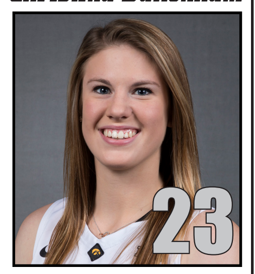
Forward • 6-0 • Sophomore Hamilton, Ontario, Canada St. Mary Catholic Secondary

2015-16... Has competed in 20 contests this season, averaging 17.0 minutes per game... registered six rebounds to match her career-high and five points against Michigan (Jan. 28)... set career-highs in points (14), field goals made (5), threepoint field goals made (3) and minutes played (27) at Purdue (Jan. 24)... matched her career-high with six rebounds in 16 minutes against Penn State (Jan. 20)... registered 20 minutes and five rebounds at Michigan State (Jan. 16)... tied her career-high with six rebounds to lead the Hawkeyes in that category and netted five points at Wisconsin (Jan. 13)... scored two points and added two rebounds off the bench against Maryland (Jan. 10)... compiled four rebounds, three points, two assists, and one block in 20 minutes off the bench at Michigan (Jan. 7)... dished out two assists in eight minutes played against Rutgers (Jan. 4)... played 16 minutes with two assists, a career-high six rebounds, and three points at Nebraska (Dec. 31)... tallied career-highs for assists (4), field goal attempts (8) and three-point field goal attempts (6) against Bradley (Dec.