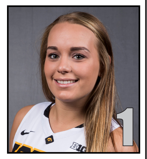
Guard • 5-10 • Junior Lincoln, Neb. Southeast

2015-16... Has played every game for lowa this season (22) with 19 starts, the first starts of her career... dished out six assists and blocked a shot at Northwestern (Jan. 31)... netted seven points and dished out two assists in lowa's win over Michigan (Jan. 28)... registered eight points and two assists against Penn State (Jan. 20)... scored the first five points of the second half for lowa against Maryland (Jan. 10)... tied a career-high with 7 rebounds and compiled nine points and four assists at Michigan (Jan. 7)... scored 20 points with three steals against Rutgers (Jan. 4)... scored 13 points with two steals in lowa's Big Ten opening win at Nebraska (Dec. 31)... recorded career-highs for field goal attempts (14), three-point field goal attempts (12) and assists (7) against Drake (Dec. 22)... netted 22 points at Virginia (Dec. 2), tying her career-high... made a career-high 8 field goals at Virginia (Dec. 2)... scored lowa's first 12 points in the second half against Virginia (Dec. 2)... netted a career-best six 3-pointers against Wright State (Nov. 26)... tallied career-highs for field goal attempts (12) and 3-point field goal attempts (9) against