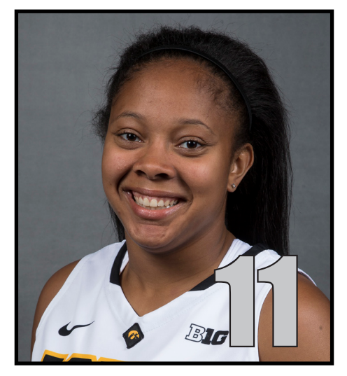
Guard • 5-4 • Freshman Grand Blanc, Mich. Goodrich

2015-16... Has played in every game of her collegiate career for the Hawkeyes (22) with five starts... made the first start of her career at point guard against Bradley (Dec. 19)... scored 11 points, pulled down four rebounds and dished out four assists at Northwestern (Jan. 31)... registered career-highs for minutes (35), points (18) and three-point field goals made (4) against Michigan (Jan. 28)... netted 14 points, dished out a career-high seven assists and played a career-high 32 minutes at Purdue (Jan. 24)... dished out a career-high six assists and matched her career-high four steals, while adding nine points against Penn State (Jan. 20)... netted a career-high 16 points and tied her career-highs five assists and six rebounds at Michigan State (Jan. 16)... recorded three rebounds, two assists, and two points at Wisconsin (Jan. 13)... scored four ponts and dished out four assists against Maryland (Jan. 10)... posted seven points and three assists at Michigan (Jan. 7)... played 28 minutes off the bench against Rutgers, compiling six points, three rebounds, and one assist (Jan. 4)... dished out four assists and scored seven points in her Big Ten Conference debut at Nebraska (Dec. 31)... scored 10 points, pulled down five rebounds, and distributed two assists