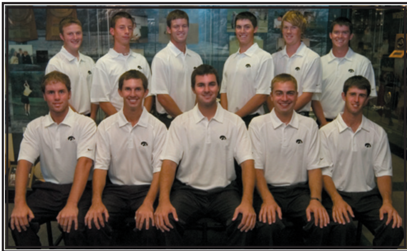
2008 University of Iowa Men's Golf Team