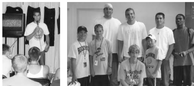
Making new friends and hanging out in the dorms with the Hawkeyes.