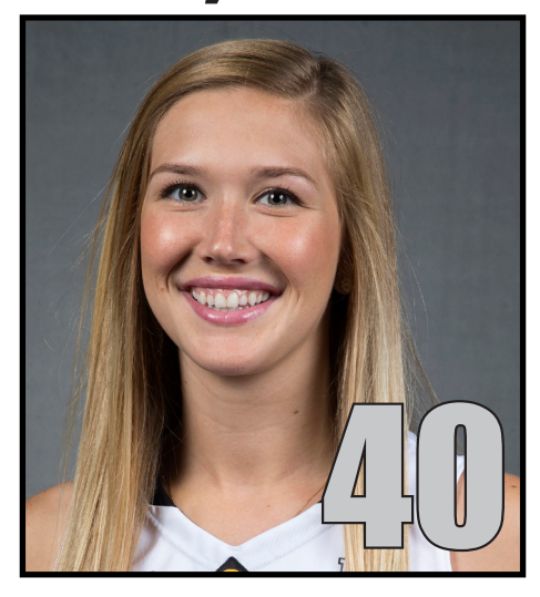
Forward • 6-2 • Senior Davenport, Iowa Assumption

2016-17... Has appeared in three contests this season.