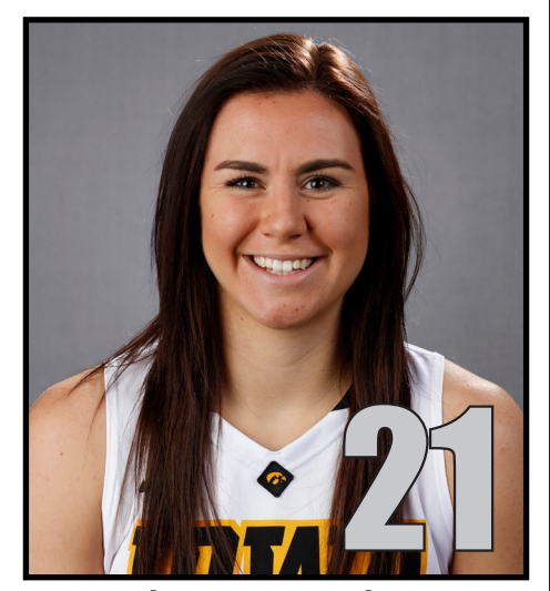
Forward • 6-2 • Sophomore Minot, N.D. Bishop Ryan Catholic

2016-17... Has appeared in all five contests this season... tied her career high with 10 points against UMass... recorded eight points, four rebounds, and two blocks in her home state of North Dakota on Nov. 16... scored a careerhigh 10 points in lowa's win over Hampton on Nov. 13.