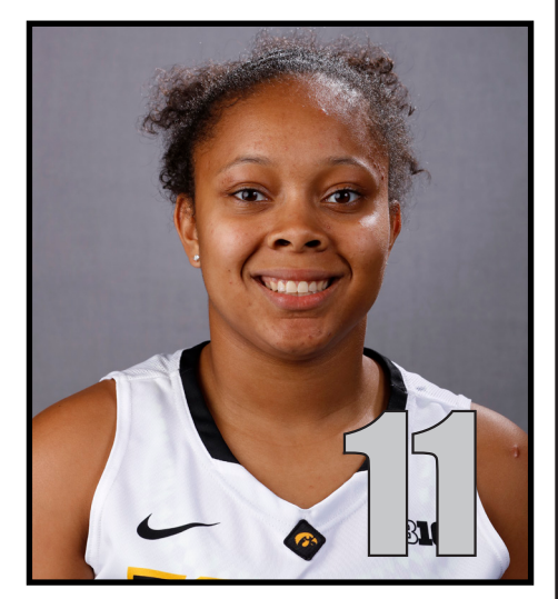
Guard • 5-4 • Sophomore Grand Blanc, Mich. Goodrich

2016-17... Has started all five contests this season... scored six points and dished out five assists against South Dakota State... netted nine points and registered five rebounds, an assist, and a steal in lowa's win at North Dakota... scored 15 points and tallied five assists in lowa's win over Hampton... netted 13 points, pulled down five boards, and dished out four assists against Oral Roberts on Nov. 11.