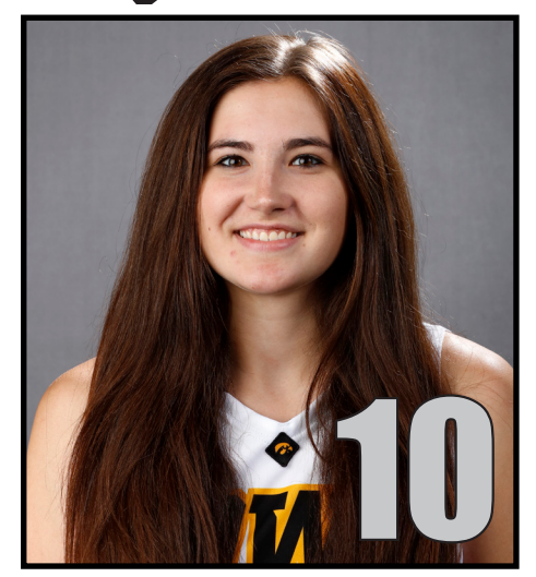
Center • 6-3 • Sophomore Port Wing, Wis. South Shore

2016-17... Has started all five contests this season... named to the 2016 Hawkeye Challenge All-Tournament Team... registered the 12th double-double of her career and third of the season with 21 points and 13 rebounds against South Dakota State... scored 13 points and pulled down eight boards in Iowa's win over UMass... recorded 12 points, six boards, two blocks, an assist and a steal and went 6-6 from the free throw line in Iowa's win at North Dakota... was named Big Ten Player of the Week on Nov. 14 following back-to-back doubledoubles against Hampton and Oral Roberts... registered her second double-double of the season with 14 points and 11 rebounds in Iowa's win over Hampton... tied career highs in points (25), field goals (10), and free throws made (5), and pulled down 12 boards in Iowa's win over Oral Roberts on Nov. 11.