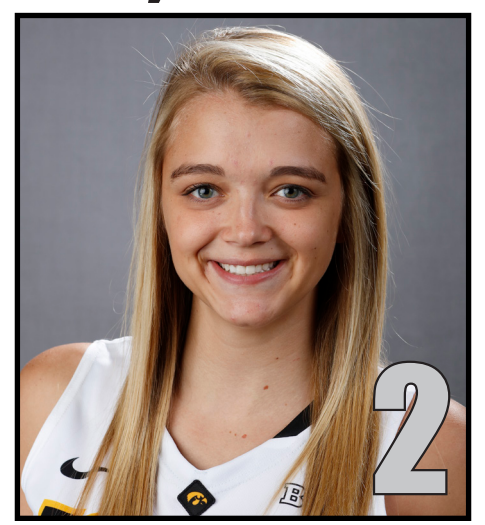
Guard • 6-0 • Senior Iowa City, Iowa West

2016-17... Has started all five contests this season... named to the 2016 Hawkeye Challenge All-Tournament Team... scored 16 points, grabbed nine rebounds, and regsitered four steals against South Dakota State... netted 10 points, dished out five assists, and pulled down seven boards in lowa's win over UMass... led all scorers with 20 points against North Dakota, adding five boards, three assists, and one steal in 30 minutes of action... netted a team-high 16 points and pulled down six boards against Hampton on Nov. 13... registered a career-high 29 points, shooting 90f-10 from the field to lead lowa past Oral Roberts on Nov. 11.