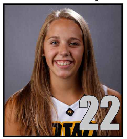
Guard • 5-9 • Freshman LaGrange Park, III. Benet Academy

2016-17... Has appeared in all five contests this season... scored six points and registered a career-high four steals against UMass... netted a career-high 11 points, and recorded two assists and three steals in lowa's win at North Dakota... scored five points and registered five assists in lowa's win over Hampton on Nov. 13... registered five points and four assists in her Hawkeye debut against Oral Roberts on Nov. 11.