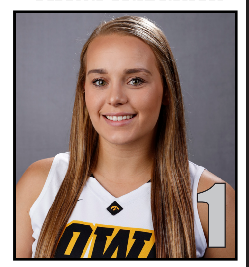
Guard • 5-10 • Senior Lincoln, Neb. Southeast

2016-17... Has appeared in all five contests this season... scored a team-high 17 on 5-10 shooting from three-point range in lowa's win over UMass... registered two points, two assists, and two steals in lowa's win at North Dakota... went 2-for-4 from 3-point range in lowa's win love Hampton on Nov. 13.