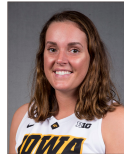
#45 Nicole Smith Senior Center