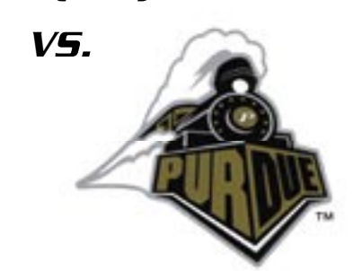
No. 9 Purdue Boilermakers (13-2, 3-1) Oct. 7, 2006 - 7 p.m. Carver-Hawkeye Arena Iowa City, IA

This Week • The University of Iowa volleyball team (11-5, 0-4) returns to North Carver this weekend for a two-game homestand with Indiana and No. 9 Purdue.