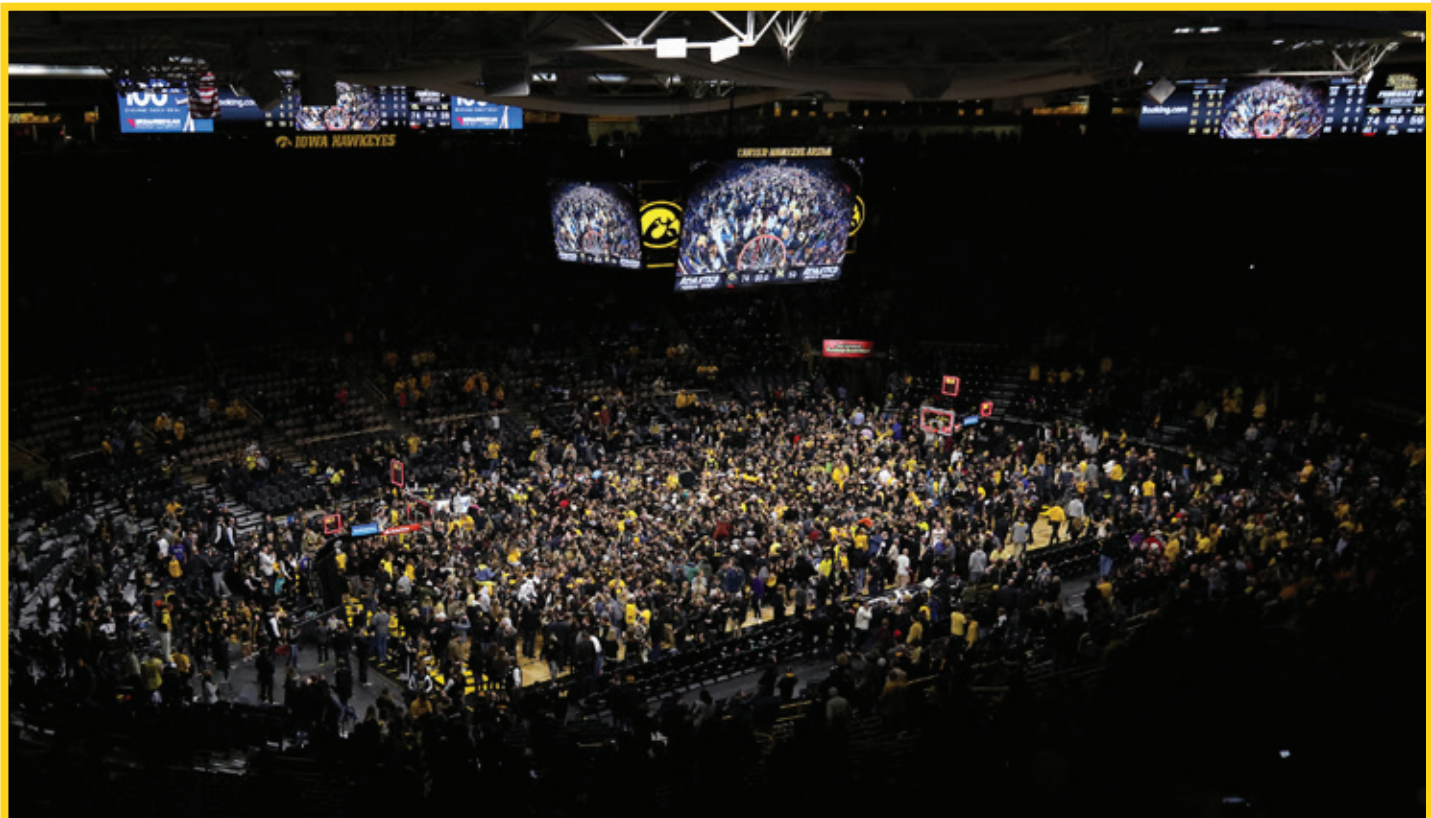
Iowa fans rushed the court at Carver-Hawkeye Arena following a 74-59 win over No. 5 Michigan on Feb. 1, 2019.

Score tied - 2 times. Lead changed - 1 time.