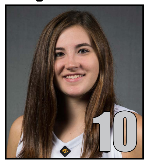
Center • 6-3 • Freshman Port Wing, Wis. South Shore

2015-16... Has appeared in every game of her Hawkeye career so far (13)... leads Iowa in field goal percentage (.571) and blocked shots (20) through 13 games... blocked three shots, scored six points, and pulled down three rebounds in her first Big Ten Conference game at Nebraska (Dec. 31)... reached double figures for the sixth time with 16 points and seven rebounds against Drake (Dec. 22)... tallied a career-high five blocks in Iowa's win at Virginia (Dec. 2)... had 11 points and eight rebounds in win over Houston (Nov. 28)... netted a careerhigh 23 points and was one rebound shy of her first career double-double against Western Illinois (Nov. 19)... tallied careerhighs for rebounds (9), field goals made (10), field goals attempted (14), steals (1), blocks (3) and minutes (29) against Western Illinois (Nov. 19)... came off the bench in Iowa's win over North Dakota (Nov. 13) for her collegiate debut... scored in double figures in three of her collegiate games so far, posting 12 points against North Dakota (Nov 13), 10 points against UT Martin (Nov. 15) and 23 against Western Illinois (Nov. 19)... named to the Hawkeye Challenge All-Tournament Team.