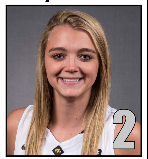
Guard • 6-0 • Junior lowa City, Iowa West

2015-16... Team elected co-captain... has started every game for the Hawkeyes (13)... named to the Big Ten Honor Roll on Dec. 7 and again on Dec. 28... leads lowa in points per game (17.2) and assists (41) through 13 games... has played in 83 career games with 64 consecutive starts... has scored in double figures in 58-of-64 career starts... ranks 24th on lowa's career scoring list with 1,201 career points and 25th all-time with 503 career rebounds... posted her first double-double of the season and the sixth of her career with 17 points and 11 rebounds at Nebraska (Dec. 31)... scored 20 points, pulled down seven rebounds, and dished out four assists to help lowa defeat Drake on Dec. 22... netted a career-high 26 points at Iowa State (Dec. 11)... registered career-highs for free throw attempts (12), steals (4) and blocks (3) at Iowa State (Dec. 11)... tallied a career-high 19 field goal attempts and added a season-high with 21 points against Western Illinois (Nov. 19)... surpassed the 1,000 career point mark with a layup in the second quarter against UT Martin (Nov. 15), becoming the 34th player in lowa women's basketball history to reach the milestone... named to the Hawkeye Challenge All-Tournament Team (MVP)... reached double figures and led the team in scoring with 20 points in Iowa's win over North Dakota (Nov. 13)... 2016 WBCA Allstate Good Works Team