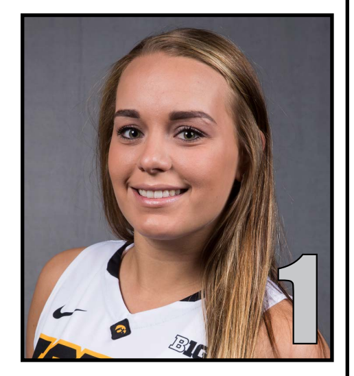
Guard • 5-10 • Junior Lincoln, Neb. Southeast

2015-16... Has started every game for lowa (13), the first starts of her career... leads lowa in steals (20), averaging 1.5 per game... scored 13 points with two steals in Iowa's Big Ten opening win at Nebraska (Dec. 31)... recorded career-highs for field goal attempts (14), three-point field goal attempts (12) and assists (7) against Drake (Dec. 22)... netted 22 points at Virginia (Dec. 2), tying her career-high... made a career-high 8 field goals at Virginia (Dec. 2)... scored lowa's first 12 points in the second half against Virginia (Dec. 2)... netted a career-best six 3-pointers against Wright State (Nov. 26)... tallied career-highs for field goal attempts (12) and 3-point field goal attempts (9) against Wright State (Nov. 26)... tied her career-high for blocks in win over Houston (Nov. 28)... was a perfect 8-for-8 from the floor, tying lowa's single game field goal percentage record (1.000), and posted career-high numbers in points (22) and three-pointers made (4) against