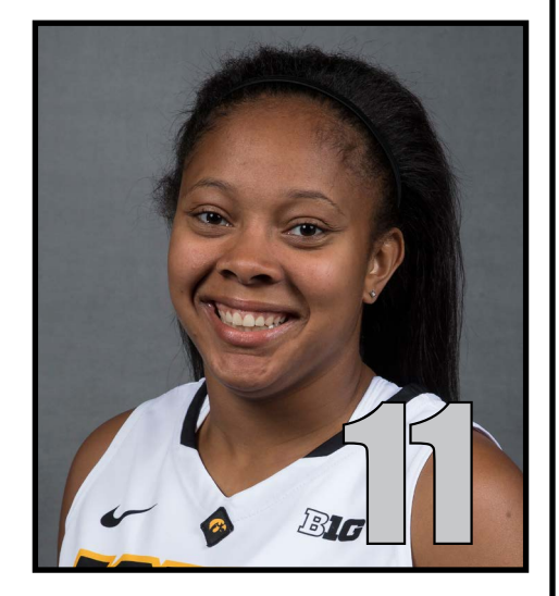
Guard • 5-4 • Freshman Grand Blanc, Mich. Goodrich

2015-16... Has played in every game of her collegiate career for the Hawkeyes (13) with two starts... made the first start of her career at point guard against Bradley (Dec. 19)... dished out four assists and scored seven points in her Big Ten Conference debut at Nebraska (Dec. 31)... scored 10 points, pulled down five rebounds, and distributed two assists against Drake (Dec. 22)... dished out a career-high five assists and tallied a career-high four steals against Bradley (Dec. 19)... took a career-high four free throw shots, making a career-high three at Virginia (Dec. 2)... netted a careerhigh 13 points in the first half alone against Wright State, reaching double digits for the first time (Nov. 26)... netted a career-high two free throws against Western Illinois (Nov. 19)... came off the bench in Iowa's win over North Dakota (Nov. 13) for her collegiate debut... reached double figures in scoring (12) for the first time in her collegiate career in win over UT Martin (Nov. 15).