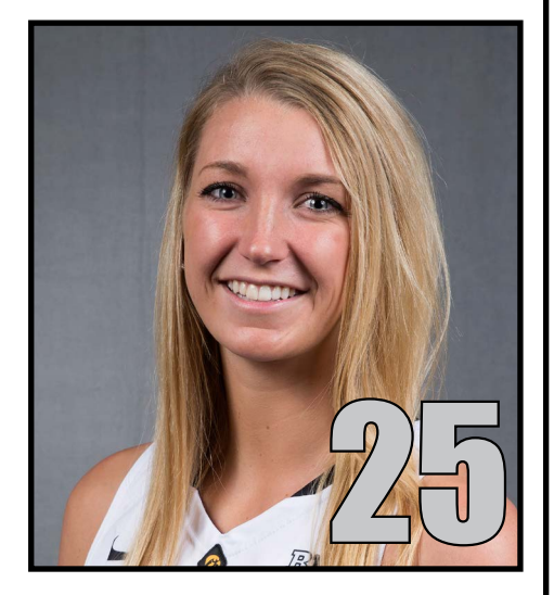
Forward • 6-1 • Senior Sauk Centre, Minn. Sauk Centre

2015-16... Team elected co-captain... has started all 13 games for the Hawkeyes... leads Iowa in rebounds (80), averaging 6.2 rebounds per game... pulled down eight rebounds and netted four points at Nebraska (Dec. 31)... matched her career-high with two steals against Bradley (Dec. 19)... tallied a career-high seven 3-point field goal attempts against Virginia (Dec. 2)... recorded a career-high 35 minutes against Western Illinois (Nov. 19)... recorded her second career double-double (13 points, 10 rebounds) with 50 seconds left in the first half against North Dakota (Nov. 13) and ended the game with 17 points and 14 rebounds... also matched career-highs with a team-high 14 rebounds, 11 field goal attempts, and three, 3-pointers made, and set a career-high with six, 3-point field goal attempts against North Dakota... reached double figures (17) in scoring in win over North Dakota (Nov. 13)... named to the Hawkeye Challenge All-Tournament Team for the second time in her career.