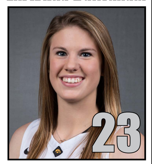
Forward • 6-0 • Sophomore Hamilton, Ontario, Canada St. Mary Catholic Secondary

2015-16... Has competed in each contest so far this season (13), averaging 16.3 minutes per game... played 16 minutes with two assists, a career-high six rebounds, and three points at Nebraska (Dec. 31)... tallied career-highs for assists (4), field goal attempts (8) and three-point field goal attempts (6) against Bradley (Dec. 19)... tied her career-high of four 3-point attempts in Iowa's win over Virginia (Dec. 2)... tallied an assist against Houston (Nov. 28)... matched her career-high with three assists against Western Illinois (Nov. 19)... reached double figures in scoring (10) and logged a career-high 24 minutes in win over North Dakota (Nov. 13)... posted a career-high five rebounds against UT Martin (Nov. 15).