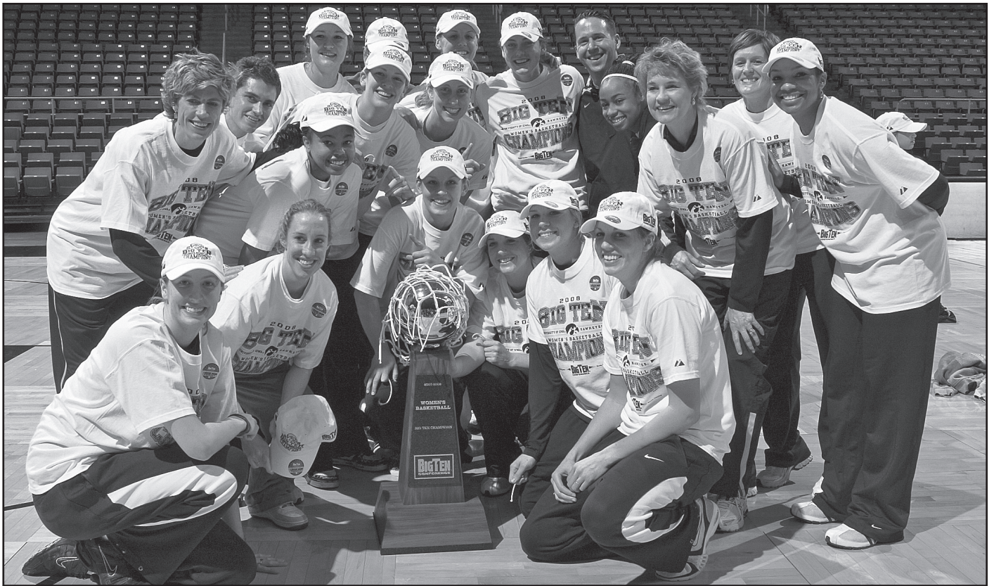
The Iowa Hawkeyes won a share of the 2008 Big Ten regular season championship.