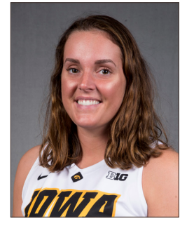
#45 Nicole Smith Senior Center