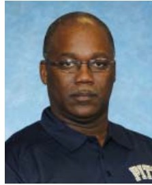
Troy Douglas Secondary