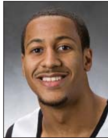
25 Junior Guard