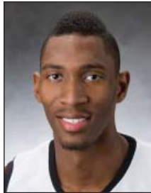
21 Freshman Forward