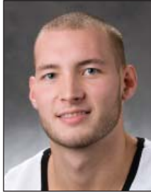
44 Senior Forward