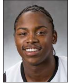
15 Freshman Guard