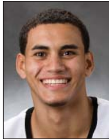
23 Freshman Wing