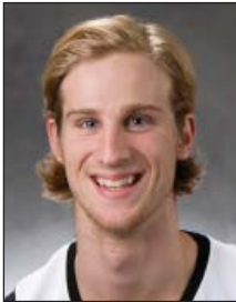
20 Freshman Guard