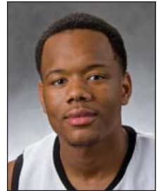
35 Freshman Wing