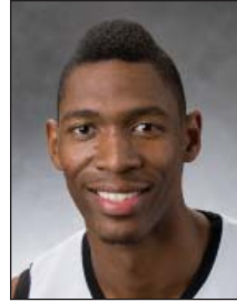
13 Freshman Forward