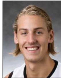
32 Sophomore G/F