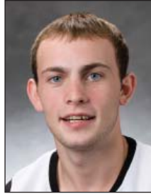
11 Freshman Guard