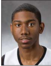
4 Junior Forward