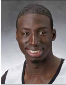
3 RS Soph. Guard