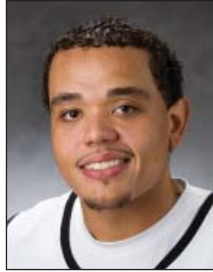
5 Senior Forward