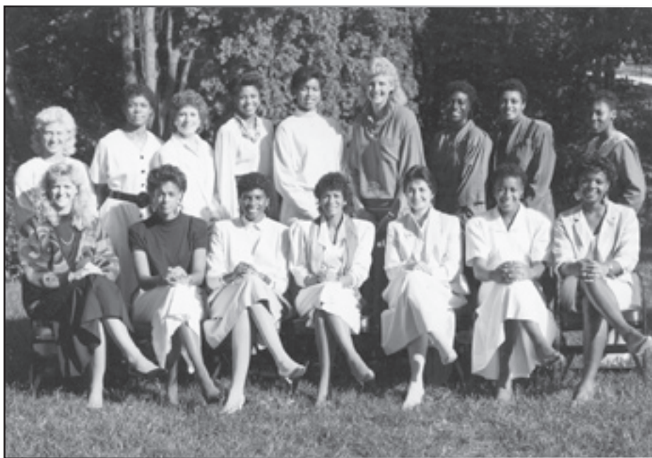
The 1987-88 Hawkeyes were the Big Ten Conference champions with a 17-1 record, and advanced to the NCAA West Regional final.