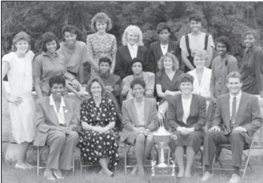
The 1990-91 Hawkeye squad were co-champions of the Big Ten Conference and finished 23-6, advancing to the NCAA Tournament.