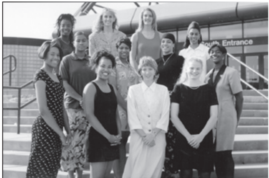
The 1996-97 Hawkeyes won the Big Ten Tournament title and advanced to the NCAA Tournament.