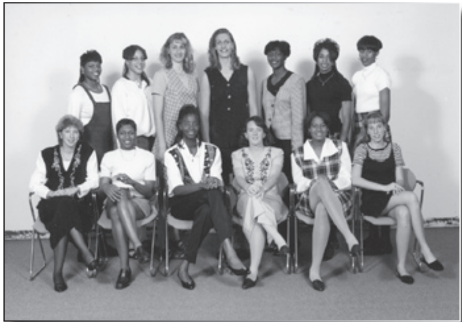
The 1995-96 Hawkeyes went undefeated at home (14-0), won their first outright Big Ten title since 1990-91 and advanced to the NCAA Midwest Regional.