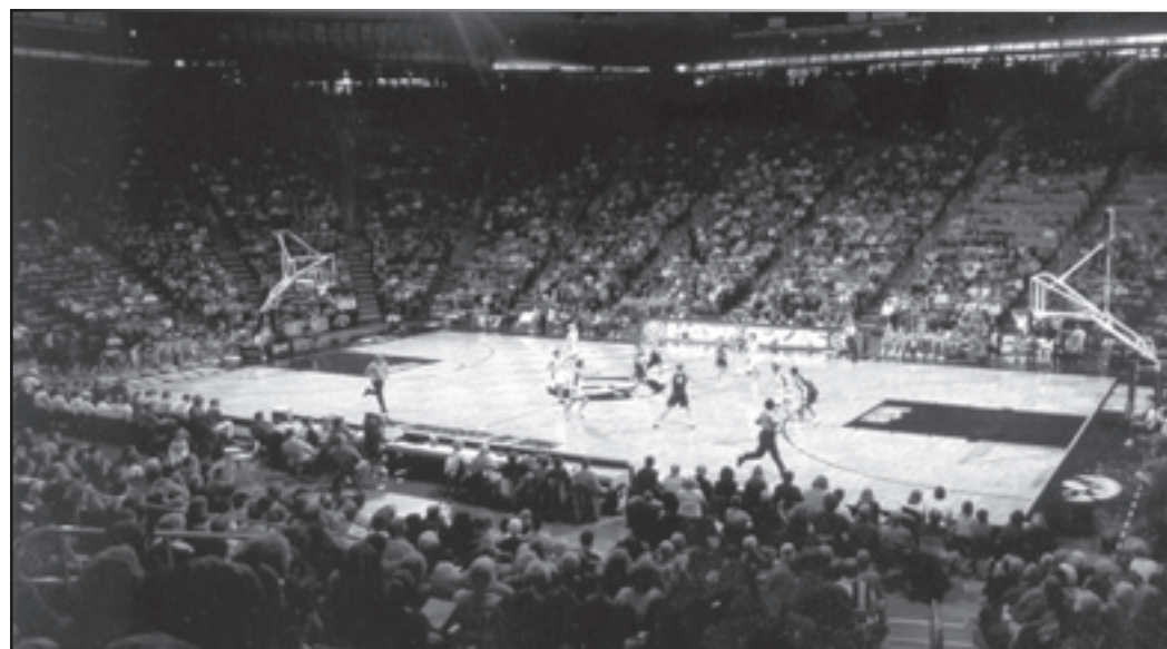
Coincidentally, over the past 33 years, four of Iowa's eight games played on December 3rd have been overtime contests, including one double overtime thriller.