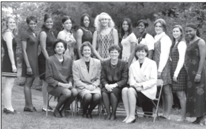
The 1997-98 Hawkeyes won the Big Ten Conference regular season with a record of 18-11 (13-3) and advanced to the second round of the NCAA Midwest Regional.