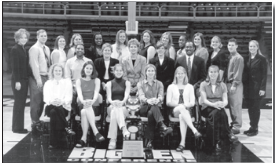
The 2000-01 Iowa Hawkeyes captured its second-ever Big Ten Tournament title and advanced to the second round of the NCAA Tournament.