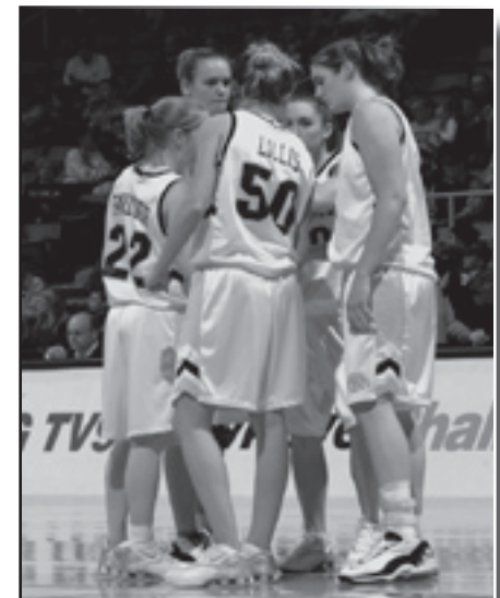
The 2003-04 Iowa Hawkeyes converted a team record 76.9 percent of its free throw attempts.