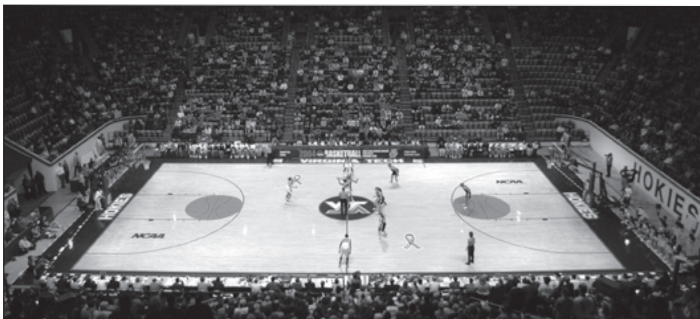
Iowa competed in its 15th NCAA Tournament last season.