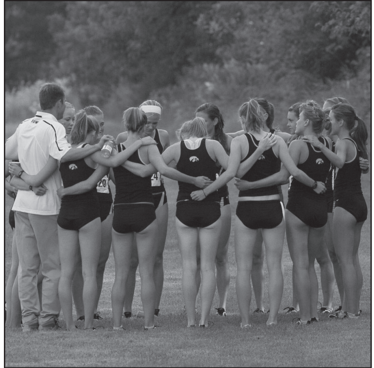
The 2009 Iowa Cross Country teams prepare for their first races of the season at the Hawkeye Invitational.