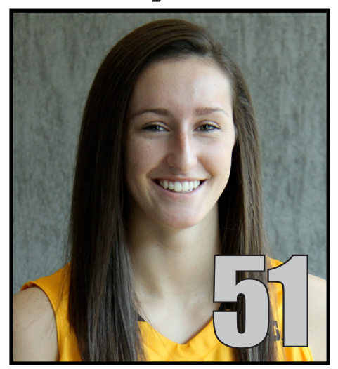
Center • 6-4 • Junior Oakdale, Minn. Hill-Murray