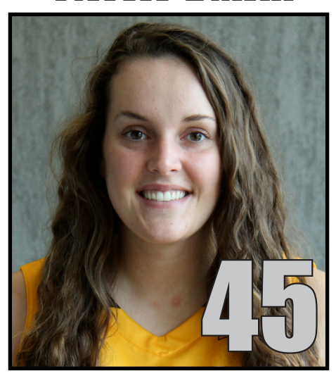
Center • 6-4 • Sophomore Rockton, III. Hononegah

• Will miss approximately 10-14 weeks with injury in right knee