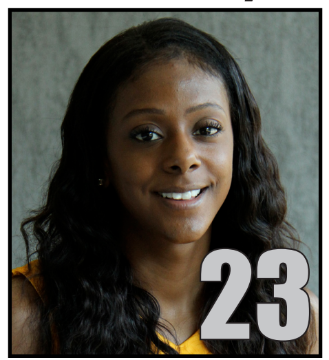
Guard • 5-11 • RS Senior St. Paul, Minn. Central