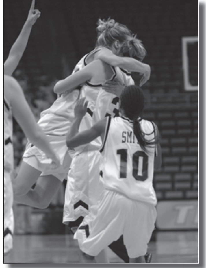
Members of the 2003-04 lowa Hawkeyes celebrate after defeating Drake in Carver-Hawkeye Arena.