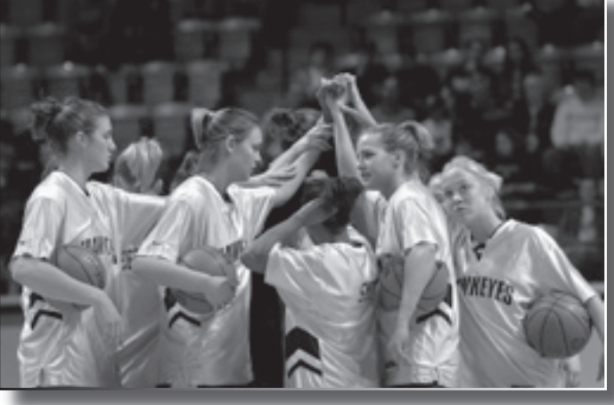
lowa and Penn State were the only conference teams to land three players each on all-Big Ten teams last season.