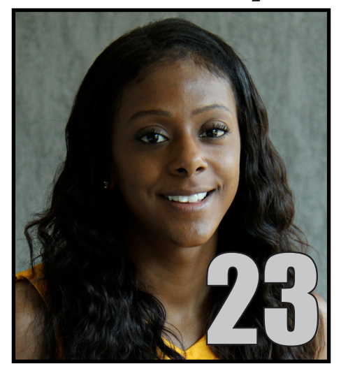
Guard • 5-11 • RS Senior St. Paul, Minn. Central