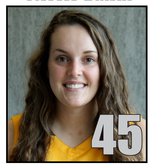
Center • 6-4 • Sophomore Rockton, III. Hononegah

• Will miss approximately 10-14 weeks with injury in right knee