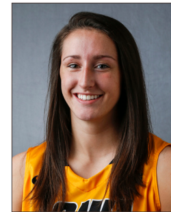
#51 Bethany Doolittle Senior Center