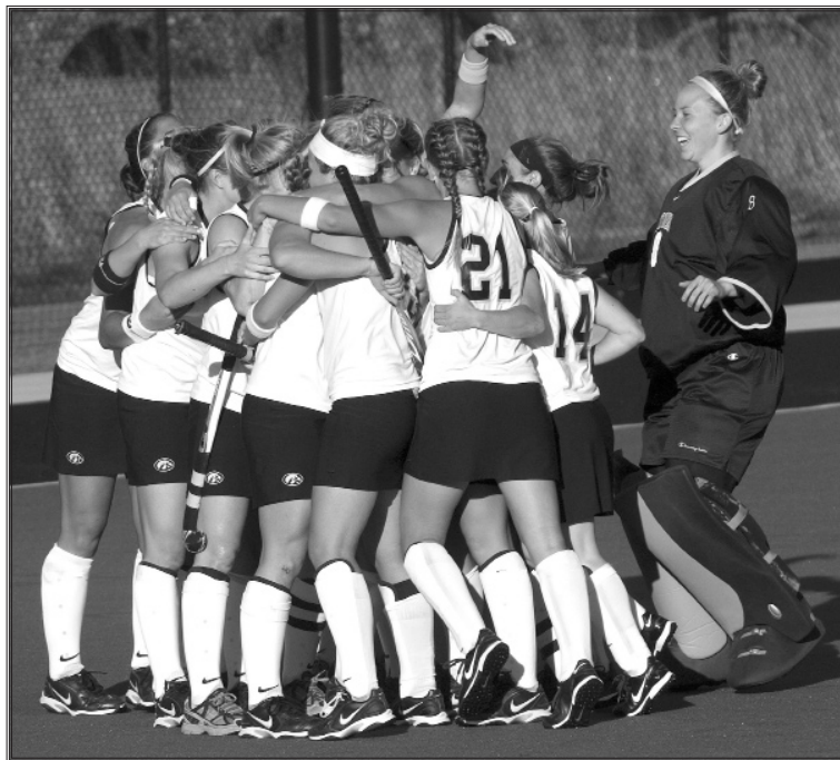
The 2008 Hawkeyes will look to win their third-straight Big Ten Tournament championship.