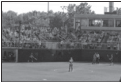
Pearl Field has hosted seven NCAA Regional tournaments, most recently in 2006.