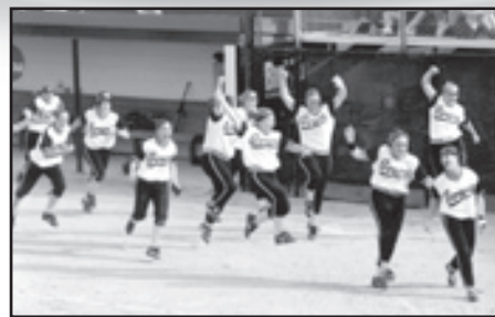
The Hawkeyes show their enthusiasm after advancing to the 2001 Women's College World Series in Oklahoma City.