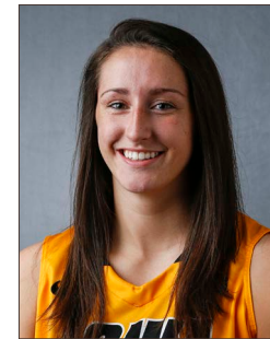
#51 Bethany Doolittle Senior Center