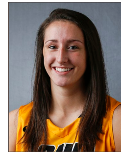
#51 Bethany Doolittle Senior Center