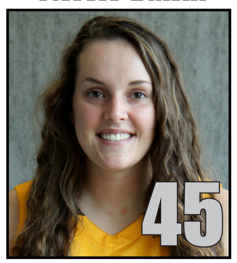
Center • 6-4 • Sophomore Rockton, III. Hononegah

• Will miss approximately 10-14 weeks with injury in right knee