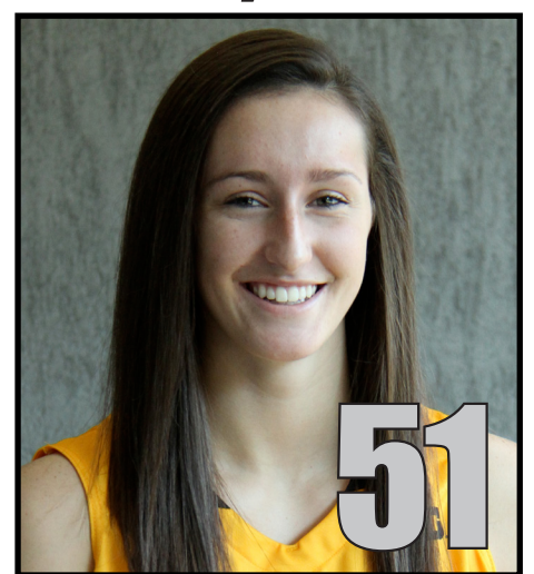
Center • 6-4 • Junior Oakdale, Minn. Hill-Murray