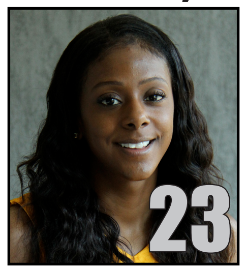
Guard • 5-11 • RS Senior St. Paul, Minn. Central