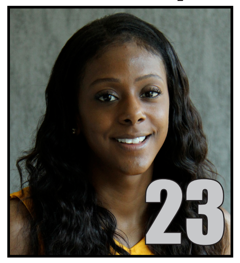
Guard • 5-11 • RS Senior St. Paul, Minn. Central