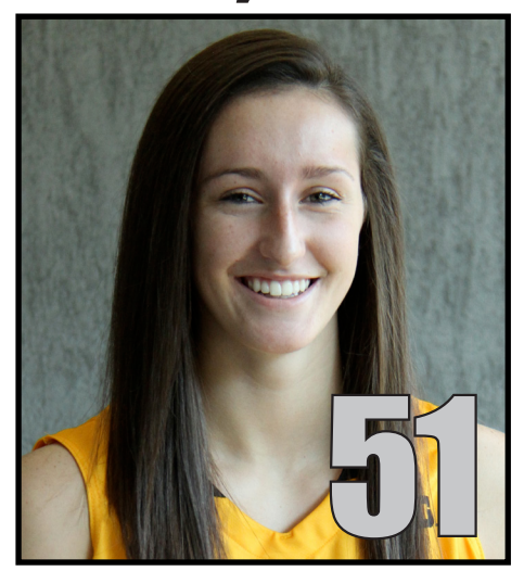
Center • 6-4 • Junior Oakdale, Minn. Hill-Murray