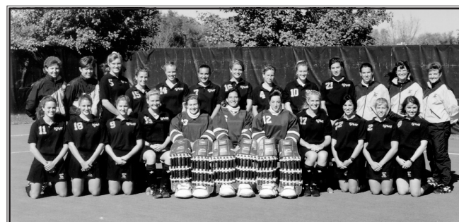
1994 Big Ten Tournament Champions 15-8 Overall, 6-4 Big Ten NCAA Tournament Final Four