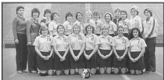
1983 Big Ten Regular Season Co-Champions

Big Ten Regular Season Champions 19-2-1 Overall, 9-1 Big Ten