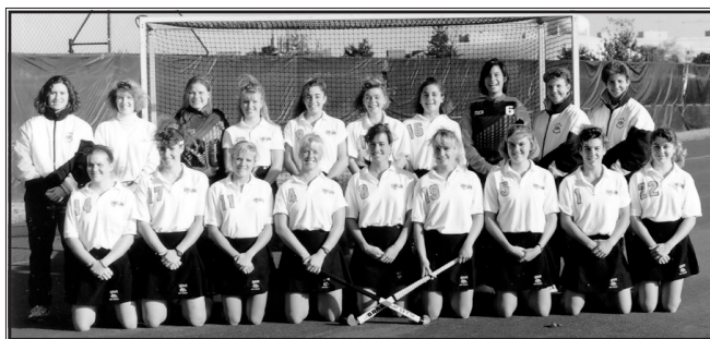
1990 MCFHC Regular Season Champions 20-4 Overall, 9-1 MCFHC NCAA Tournament Final Four (Third Place)