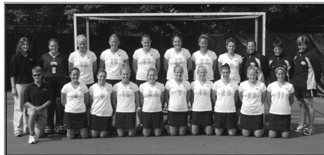
2004 Big Ten Regular Season Co-Champions 13-8 Overall, 5-1 Big Ten NCAA Tournament