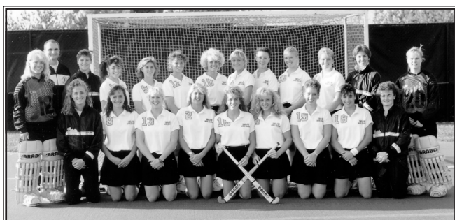
1991 MCFHC Regular Season Champions 17-2-1 Overall, 10-0 MCFHC NCAA Tournament Elite Eight