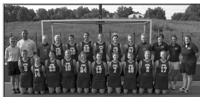
2007 Big Ten Tournament Champions 17-4 Overall, 4-2 Big Ten NCAA Tournament