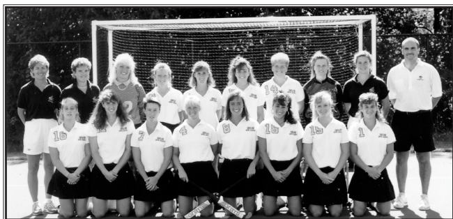
1989 MCFHC Regular Season Champions 19-2-2 Overall, 9-0-1 MCFHC NCAA Tournament Final Four