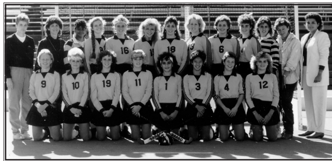
1986 NCAA Champions

21-2 Overall, 6-0 Big Ten Iowa's first NCAA Tournament, Elite Eight