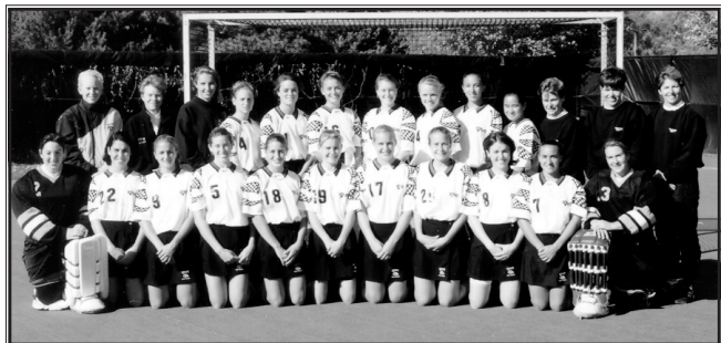
1995 Big Ten Regular Season Champions 16-4 Overall, 10-0 Big Ten NCAA Tournament Elite Eight