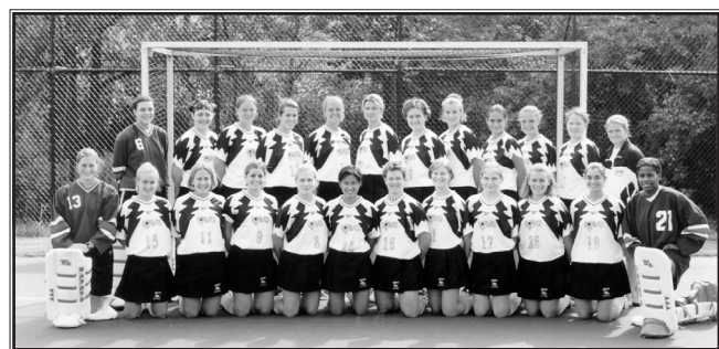
1999 Big Ten Regular Season Champions 19-3 Overall, 9-1 Big Ten NCAA Final Four