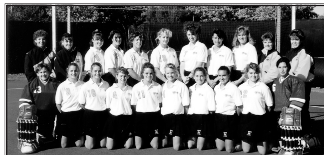
1993 Big Ten Regular Season Runner-up 18-4 Overall, 8-2 Big Ten NCAA Tournament Final Four