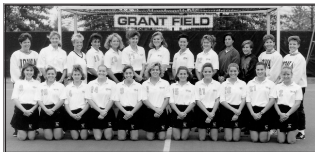
1992 NCAA Tournament Runner-up Big Ten Regular Season Champions 20-1 Overall, 10-0 Big Ten