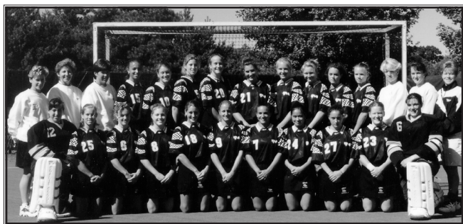
1996 Big Ten Regular Season Champions 18-3 Overall, 10-0 Big Ten NCAA Elite Eight