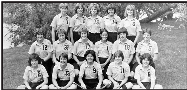
1982 Big Ten Regular Season Champions

21-2 Overall, 6-0 Big Ten Iowa's first NCAA Tournament, Elite Eight