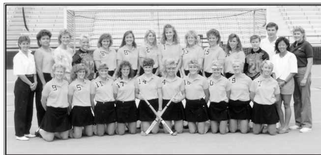
1988 NCAA Tournament Runner-up

Big Ten Regular Season Runner-up 17-5-3 Overall, 8-1-1 Big Ten