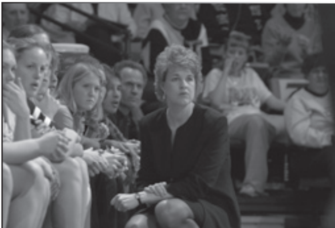
Coach Bluder was named the 2001 Big Ten Coach of the Year.

Bluder is recognized as one of the top bright coaches around the country. Following her initial year at Iowa, Bluder signed a contract extension that runs through the 2009 season.