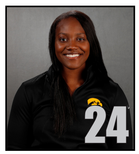
Guard • 5-8 • Sophomore Evansville, Ind. Central