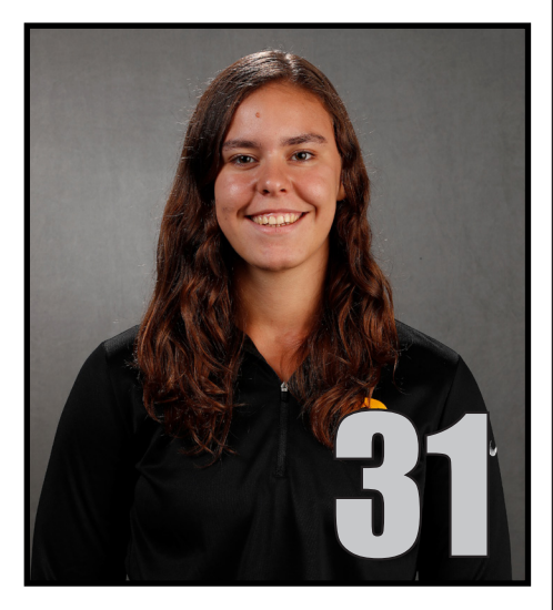
Forward • 6-3 • Sophomore Ourense, Spain IES Otero Pedrayo

Made her season debut in Iowa's 104-67 victory over Western Kentucky on Nov. 13.