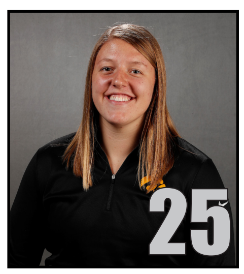
Forward • 6-3 • Freshman Watertown, Minn. Watertown-Mayer