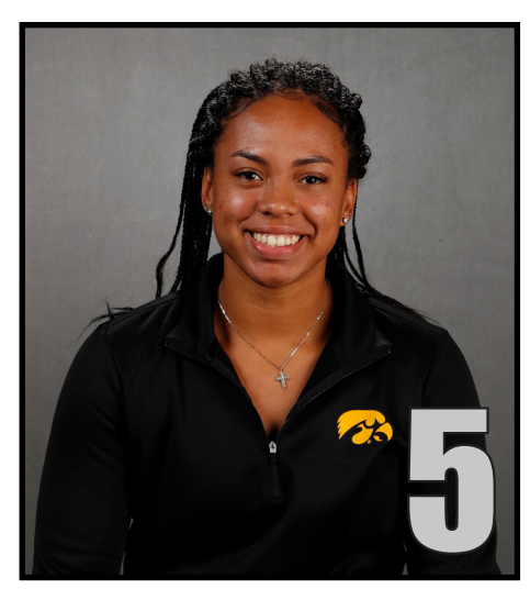
Guard • 5-5 • RS-Sophomore Goodrich, Mich. Goodrich