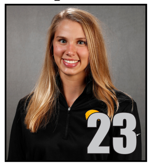
Forward • 6-1 • Freshman Iowa City, Iowa West