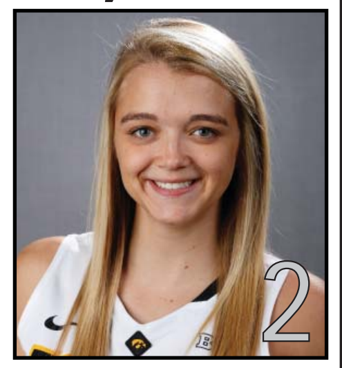
Guard • 6-0 • Senior Iowa City, Iowa West