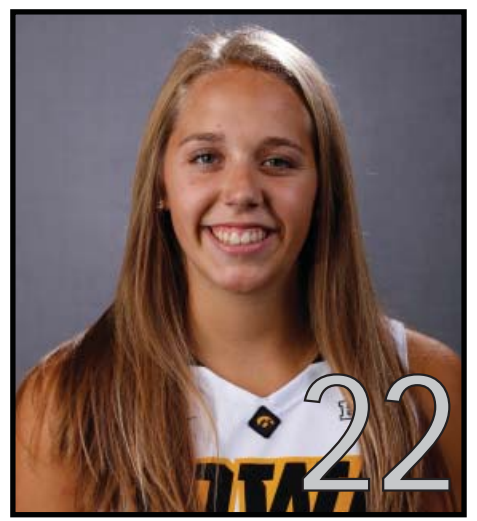
Guard • 5-9 • Freshman LaGrange Park, III. Benet Academy