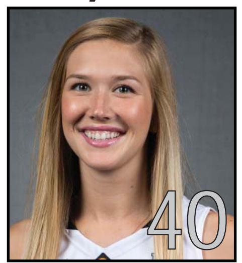
Forward • 6-2 • Senior Davenport, Iowa Assumption

2016-17... Has appeared in 12 contests this season... pulled down two rebounds in lowa's win over Kent State... scored four points and recorded a steal in lowa's win over UNI.