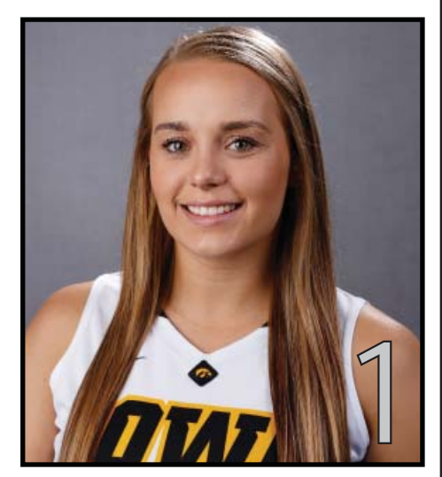
Guard • 5-10 • Senior Lincoln, Neb. Southeast

2016-17... Has appeared in all 33 contests this season with three starts... netted a team-high 19 points on 5-of-9 shooting from 3-point range in Iowa's WNIT win over Colorado on March 23... scored seven points and was a perfect 4-for-4 from the free throw line in Iowa's WNIT Second Round win over South Dakota on March 18... netted eight points in Iowa's WNIT First Round win over Missouri State on March 16... hit backto-back 3-pointers to extend lowa's fourth quarter lead and seal a win over Wisconsin on Feb. 26... netted eight points, pulled down four rebounds, and dished out three assists in the contest... tied a career-high with seven rebounds at Indiana on Feb. 22... registered eight points, five rebounds, and three assists in lowa's win over Northwestern on Feb. 16... netted seven points and pulled down three boards at No. 13 Ohio State... scored six points and dished out two assists in Iowa's win over Kent State... recorded five points, three assists and three steals in Iowa's win over UNI... scored a team-high 17 on 5-10 shooting from three-point range in Iowa's win over UMass... registered two points, two assists, and two steals in Iowa's win at North Dakota... went 2-for-4 from 3-point range in lowa's win love Hampton on Nov. 13.