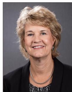
Lisa Bluder Head Coach