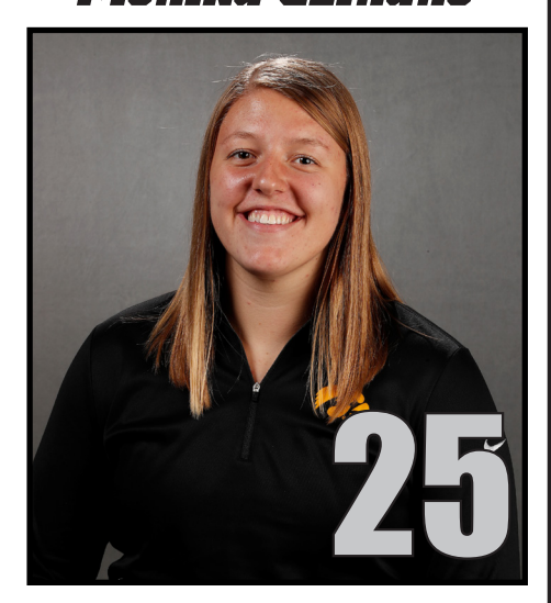
Forward • 6-3 • Freshman Watertown, Minn. Watertown-Mayer