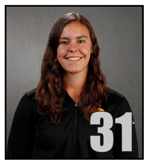
Forward • 6-3 • Sophomore Ourense, Spain IES Otero Pedrayo

Made her season debut in Iowa's 104-67 victory over Western Kentucky on Nov. 13.