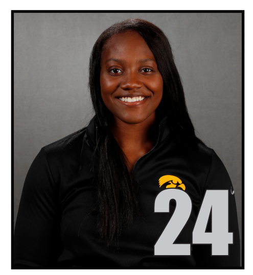
Guard • 5-8 • Sophomore Evansville, Ind. Central