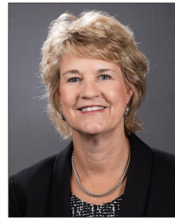
Lisa Bluder Head Coach